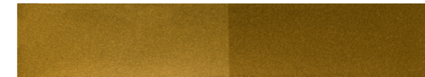
Maize Gold 5 – 50 µm Article No. 060323