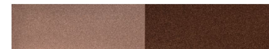
Bright Cinnamon 15 – 70 µm Article No. 060245