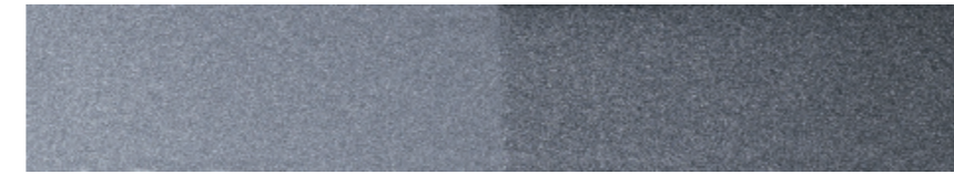
Bright Silver Sea 15 – 70 µm Article No. 040443