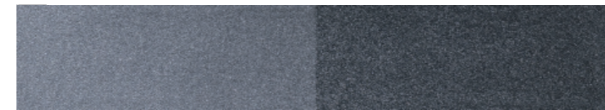
Sparkling Silver Sea 20 – 95 µm Article No. 040966