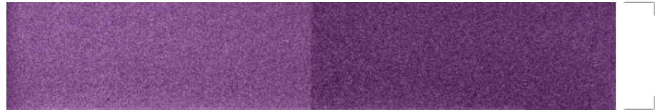
Bright Splendid Red 34 15 – 70 µm Article No. 041711