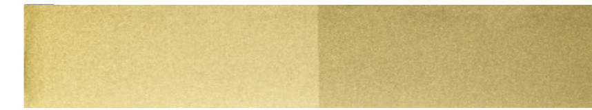
Natural Gold 5 – 50 µm Article No. 060314