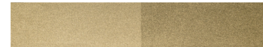
Bright Sunflower Gold 15 – 70 µm Article No. 060243