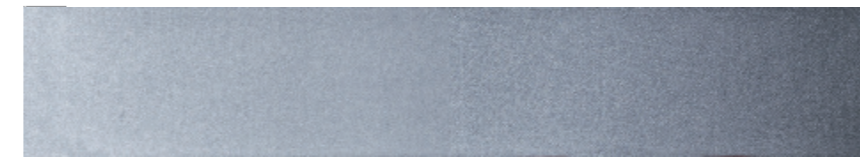
Splendid Silver Sea 5 – 50 µm Article No. 022686