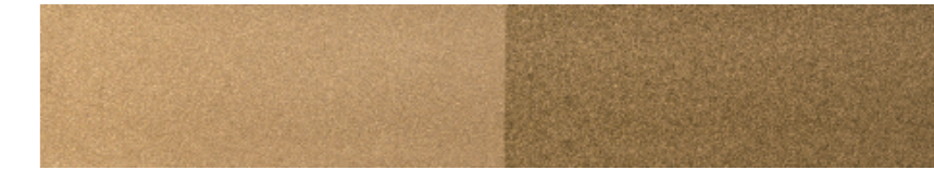
Bright Honey 15 – 70 µm Article No. 060244