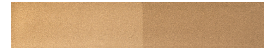
Honey 5 – 50 µm Article No. 060316